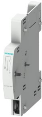
Auxiliary switch 1 CO for RCBO 2/3/4P Un: 230/400V