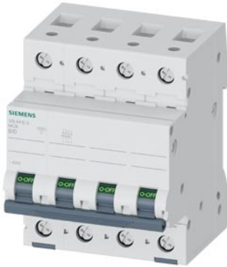
Miniature circuit breaker 400 V 10kA, 4-pole, B, 10 A