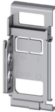
locking provision for handle accessory for: 3VA41