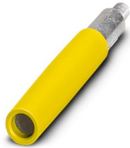
Test plug strip, number of positions: 1, color: yellow

Please be informed that the data shown in this PDF document is generated from our online catalog. Please find the complete data in the user documentation. Our general terms of use for downloads are valid.