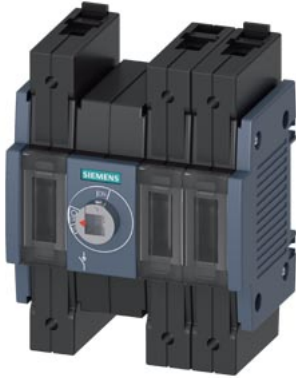
SWITCH-DISCONNECTOR 80A, FRAME SIZE 1, 3-POLE FRONT OPERATING CENTER BASIC UNIT WITHOUT HANDLE BOX TERMINAL