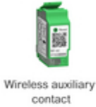
Wireless auxiliary contact