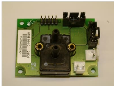
ABB Automation GmbH 758014