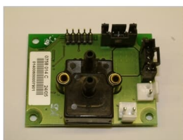
ABB Automation GmbH 8000000000758014