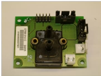
ABB Automation GmbH 8000000000758014

Parts & Services > Measurement and Analytics > Analytical Measurement > Continuous Gas Analyzers > OEM Analyzers > EL3010-C > Magnos28