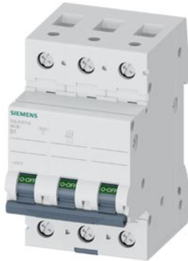
Miniature circuit breaker 400 V 10kA, 3-pole, B, 1 A