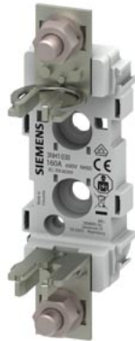
HRC fuse base plastic Sz. 00, 1-pole 160A 690V flat terminal