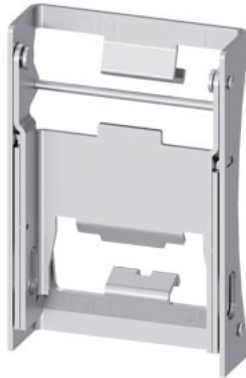
handle blocking device accessory for: 3VA55/65/66