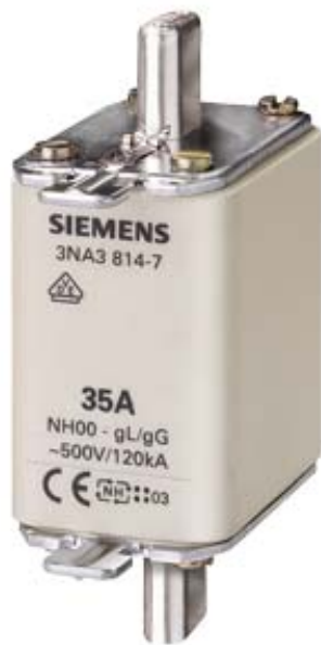
LV HRC FUSE LINK GL/GG WITH NON-INSULATED GRIP LUGS WITH FRONT INDICATOR SIZE 00, 35A, AC 500V/DC 250V