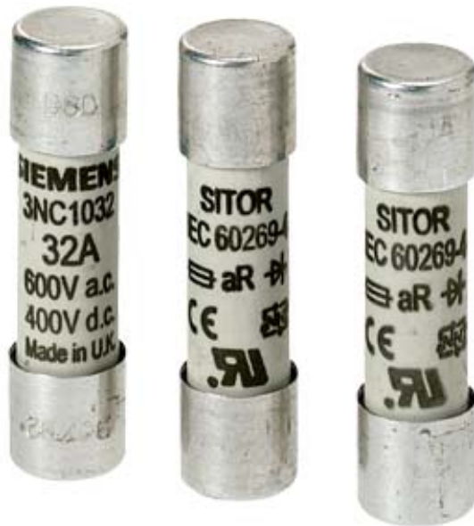
SITOR CYLIND. FUSE-LINK AR WITH HAMMER 14X51 32 A, 690 V