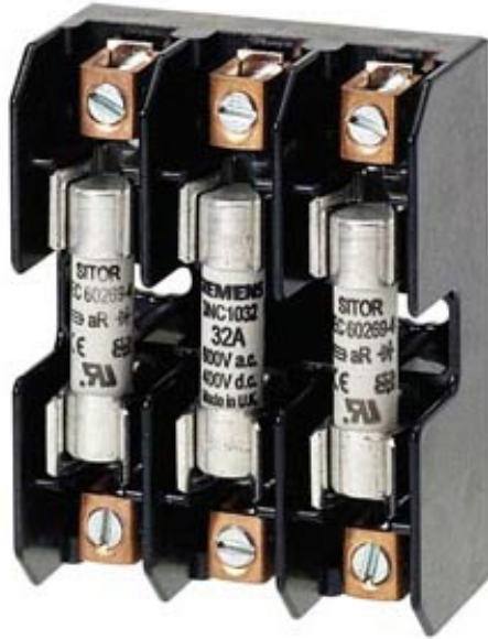
SITOR FUSE BASE 1P 14X51, UP TO 50 A, 690 V AC