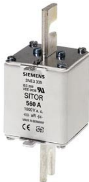
SITOP FUSE-LINK FOR SEMICONDUCTOR PROTECTION 560A GR 690V SIZE 3 CONNECTION CONTACT INDICATOR 110MM