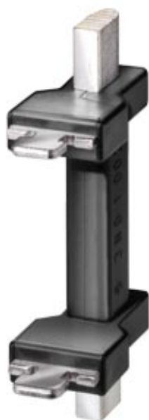
LV HRC ISOLATING LINK, SIZE 00 WITH INSULATED GRIPPING LUG