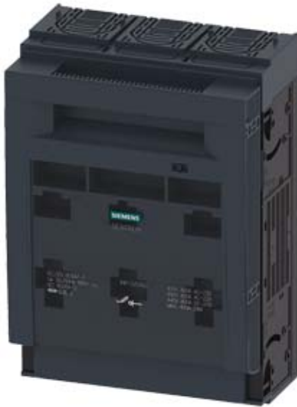
FUSE-SWITCH-DISCONNECTOR 3-POLE, NH2, 400A MOUNTING PLATE CONSTRUCTION COVER LEVEL 70 MM FLAT CONNECTOR