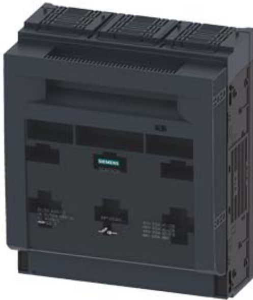
FUSE-SWITCH-DISCONNECTOR 3-POLE, NH3, 630A MOUNTING PLATE CONSTRUCTION COVER LEVEL 70 MM BOX TERMINAL