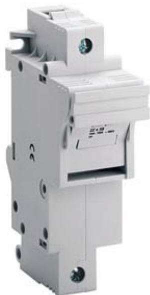
BUILT-IN FUSE BASE FOR CYLINDRICAL FUSES SIZE 22X58MM 100A, 3POLE