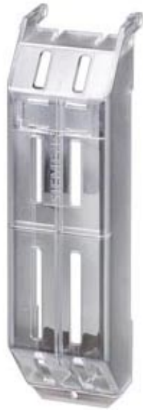
ISO SHROUDING COVER IP2X FOR LV HRC FUSE BASE SIZE 00