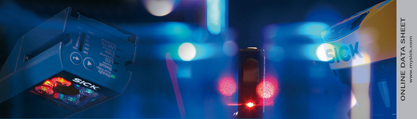
Image-based code readers ICR847-2 / ICR847-2E / Extended Long Range