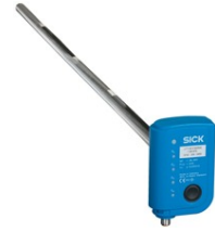
Product may differ from illustration