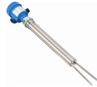
Product may differ from illustration