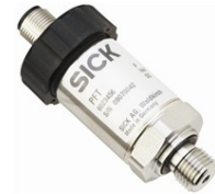
Product may differ from illustration