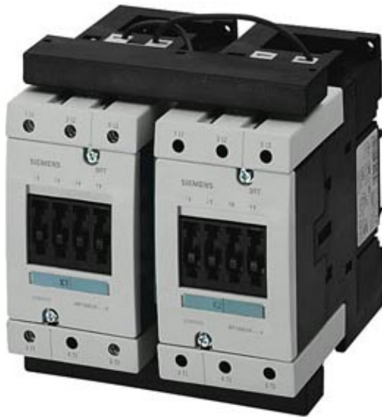
REVERSING CONTACTOR COMBINATION 30KW, SIZE S3, AC 24V 50/60HZ