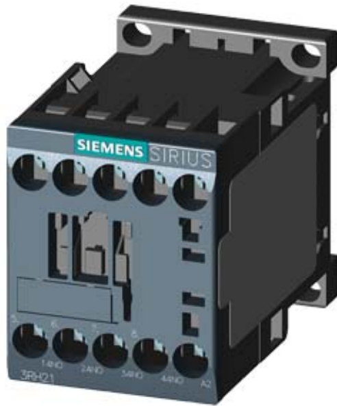
CONTACTOR RELAY, 4NO, AC 220V 50HZ, 240V 60HZ, SIZE S00, SCREW TERMINAL