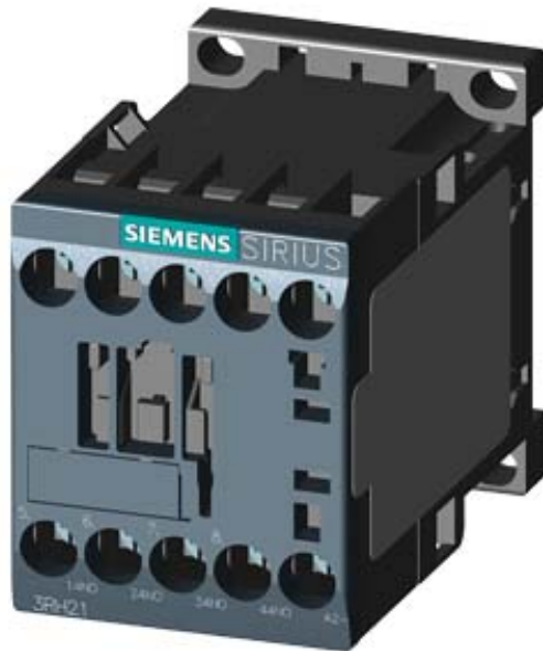
COUPLING CONTACTOR RELAY, 4NO, DC 24V, 0.7...1.25*US, SIZE S00, SCREW TERMINAL