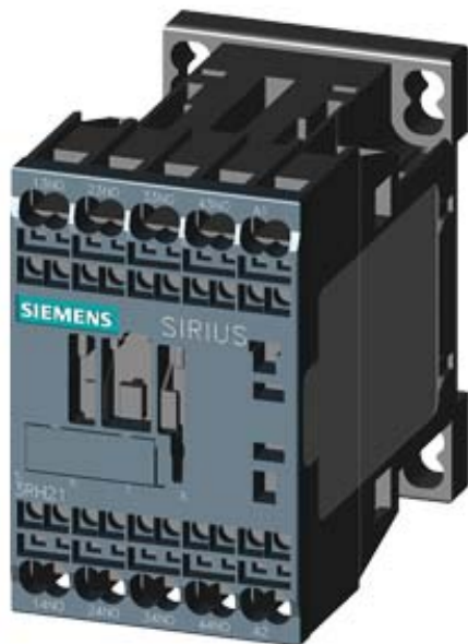
CONTACTOR RELAY, 4NO, AC 42V, 50/60 HZ, SZ S00, SPRING-LOADED TERMINAL