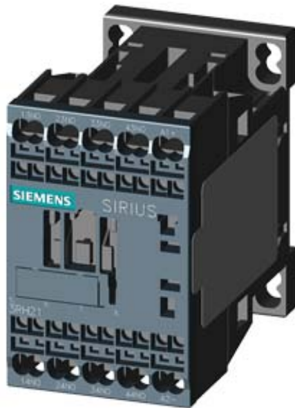
CONTACTOR RELAY, 4NO, DC 125V, SZ S00, SPRING-LOADED TERMINAL