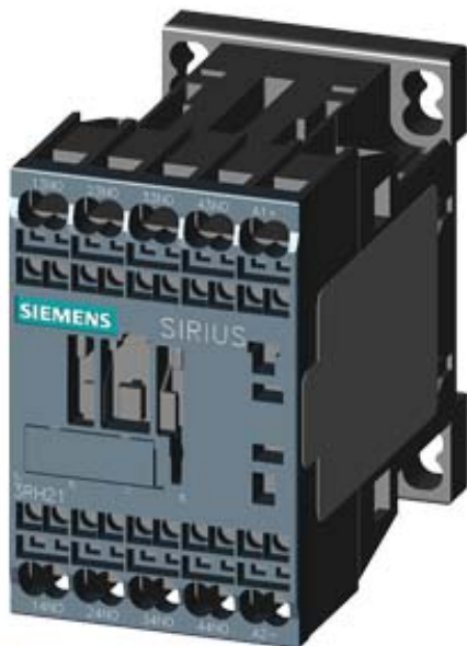
CONTACTOR RELAY, 4NO, DC 220V, SZ S00, SPRING-LOADED TERMINAL