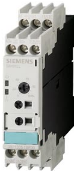
MULTI-FUNCTION TIME RELAY CAGE CLAMP TECHNIQUE 1 CHANGEOVER CONTACT WITH OFF- DELAY 0.5S...10S AC/DC 24V/AC 200...240V