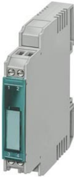
INTERFACE CONVERTER PASSIVE SEPARATORS, 1-CHANNEL ON: 0/4 TO 20 MA OFF: 0/4 TO 20 MA WIDTH 6.2 MM CAGE CLAMP