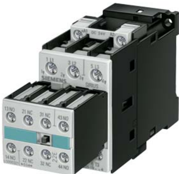
CONTACTOR, AC-3 4KW/400V, AC 230V 50/60 HZ, 3-POLE, SIZE S0, SCREW CONNECTION