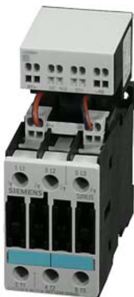
CONTACTOR, AC-3 5,5 KW/400 V, AC230V 50/60HZ 3-POLE, SIZE S0, SCREW CONNECTION