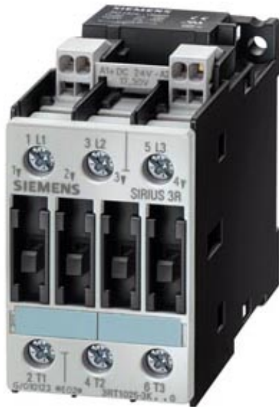
CONTACTOR, AC-3 7.5KW/400 V, DC 230 V, 3-POLE, SIZE S0, CAGE CLAMP