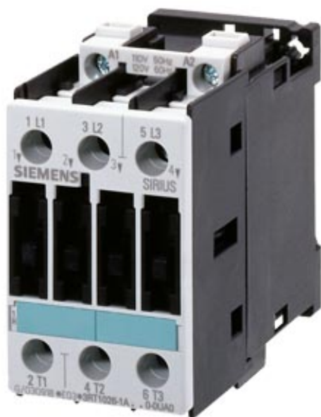
CONTACTOR, AC-3 11 KW/400 V, AC110V 50/60HZ, 3-POLE, SIZE S0, SCREW CONNECTION