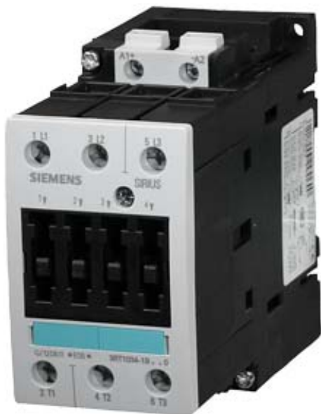
CONTACTOR, AC-3 18.5 KW/400 V, DC 125 V, 3-POLE, SIZE S2, SCREW CONNECTION