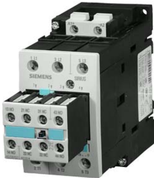
CONTACTOR, AC-3 22 KW/400 V, DC 110 V, 3-POLE, 2 NO + 2 NC, SIZE S2, SCREW CONNECTION