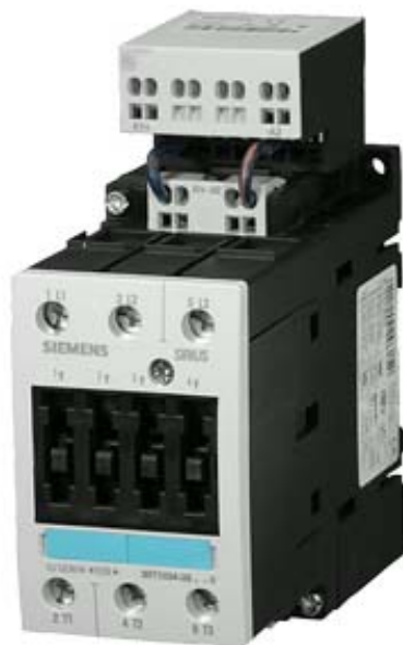
CONTACTOR, AC-3 22KW/400 V, AC230V 50/60HZ, 3-POLE, SIZE S2, CAGE CLAMP