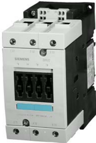
CONTACTOR, AC-3 30 KW/400 V, AC 100 V, 50 HZ/100...110V,60HZ 3 POLE, MOD. S3, CAGE CLAMP