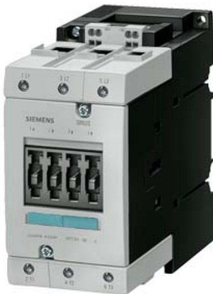
CONTACTOR, AC-3 30 KW/400 V, DC 42V, 3-POLE, SIZE S3, CAGE CLAMP