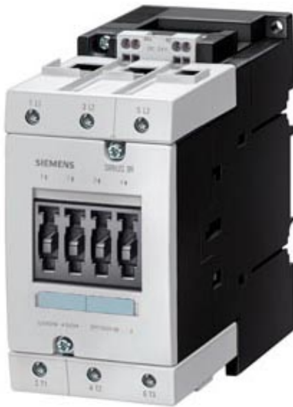
CONTACTOR, AC-3 37 KW/400 V, AC 24 V, 50 HZ, 3-POLE, SIZE S3, CAGE CLAMP