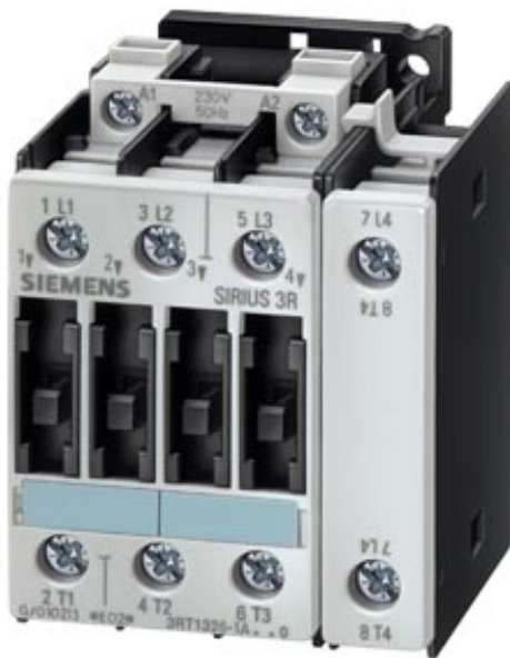
CONTACTOR, AC-1 40 A, DC 110 V, 4-POLE, SIZE S0, SCREW CONNECTION