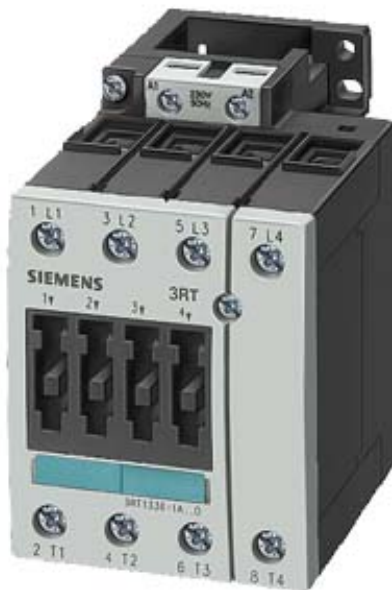
CONTACTOR, AC-1 60 A, AC 100 V, 50 HZ/100...110V,60HZ 4 POLE, MOD. S2, SCREW CONNECTION