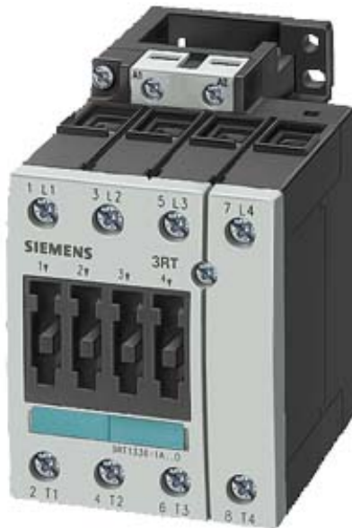
CONTACTOR, AC-1 60 A, AC 600 V 60 HZ 4-POLE, SIZE S2, SCREW CONNECTION