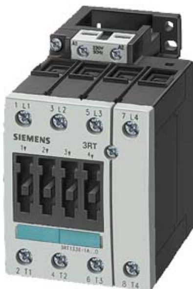
CONTACTOR 1-PH, 60A, 48 V DC, 4-POLE, SIZE S2, SCREW CONNECTION