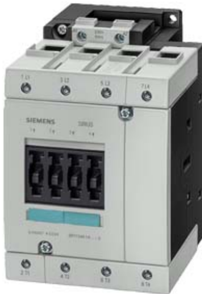
CONTACTOR, AC-1 110 A, DC 42 V, 4-POLE, SIZE S3, SCREW CONNECTION AVAILABLE MARCH '98