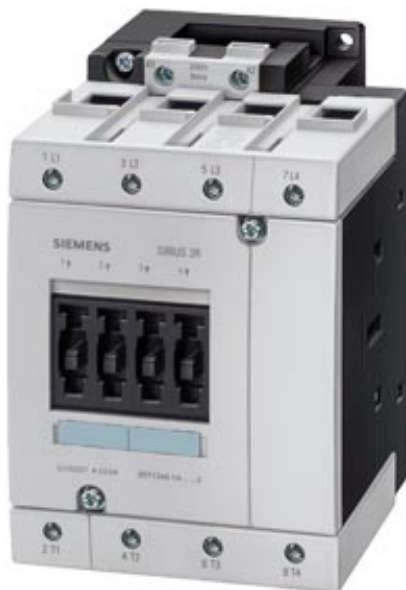
CONTACTOR, AC-1 140 A, AC 240 V 50 HZ 4-POLE, SIZE S3, SCREW CONNECTION