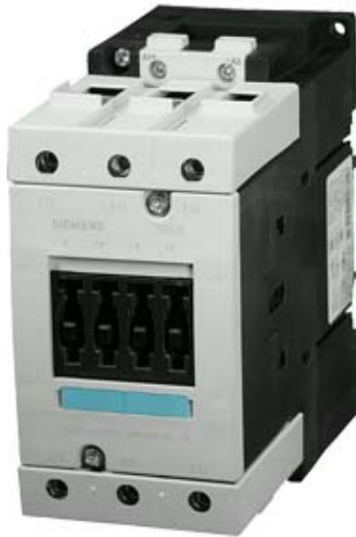
CONTACTOR, AC-1 140 A/400 V, DC 42 V, 3-POLE, SIZE S3, SCREW CONNECTION