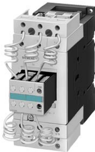
CAPACITOR SW. CONTACTOR, AC-6, 50KVAR/400V, AC 200V 50/60HZ/ AC 220V 60HZ, 3-POLE, SIZE S3