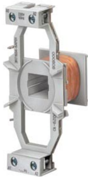
COIL FOR CONTACTORS SIRIUS, SIZE S2, CAGE CLAMP CONNECTION DC 110 V